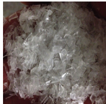
ABRASIVE POLYCARBONATE CHIPS

One of the world's top six petrochemical companies, a leading manufacturer of chemicals, fertilizers, plastics and metals had a problematic flexible connection that other products and suppliers could not resolve. The process was the manufacturing of sliced polycarbonate chips which are extremely abrasive. The connector is situated between the separator and the cyclone and was only lasting between two and five days.